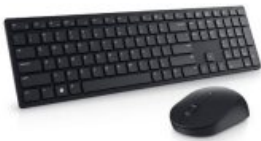
Dell Pro Wireless Keyboard and Mouse - KM5221W

Work from anywhere with this Bluetooth Teams certified headset that lets you switch seamlessly to your PC or smartphone and enjoy crystal clear audio on the go.