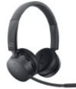
Dell Pro Wireless Headset - WL5022

Create a clutter-free desk and securely house your Dell Monitors with this compact all-in-one stand optimized for your comfort.