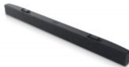
Dell Slim Soundbar - SB521A

Enhance your everyday productivity with a quiet full-size keyboard and mouse combo that offers programmable shortcuts and 36 months battery life.