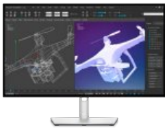
Dell UltraSharp 27 4K USB-C Hub Monitor - U2723QE

Be your most productive on a 27 inch monitor with brilliant color and contrast that features the industry's first IPS Black technology** and a connectivity hub.