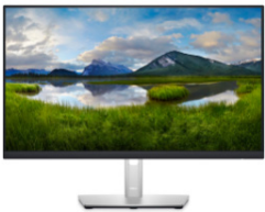
DELL 24 MONITOR | P2422H

Stay productive no matter where you work with this sleek 23.5" FHD monitor with ComfortView.