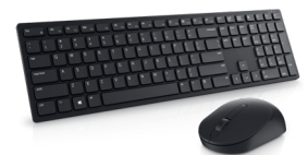
DELL PRO WIRELESS KEYBOARD AND MOUSE | KM5221W

Optimize conference calls and multimedia streaming with exceptional audio clarity. Minimize background noise while on calls with the dual mic array and echo cancellation feature.