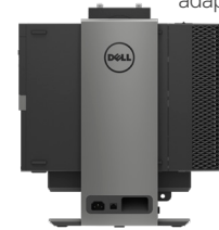
OPTIPLEX SMALL FORM FACTOR ALL-IN-ONE STAND

Small footprint mounting solution adapts to your environment, with cable management and monitor height adjustability, tilt, swivel and pivot functions.