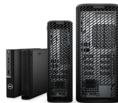
OPTIPLEX CABLE COVERS

Experience exceptional audio clarity with this Teams certified wired headset that allows you to wear the microphone on either side for a customized fit.