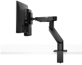
DELL SINGLE MONITOR ARM - MSA20

Maximize your desk space with this sleek arm that supports both system and monitor mounting.