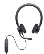
DELL PRO WIRED HEADSET - WH3022 (COMING SOON)

Custom dust filters safeguard internal components in factory, warehouse, or retail environments.