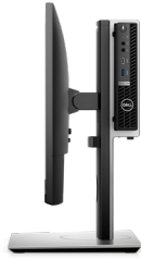
OPTIPLEX MICRO ALL-IN-ONE STAND

Small footprint mounting solution adapts to your environment, with cable management and monitor height adjustability, tilt, swivel and pivot functions.