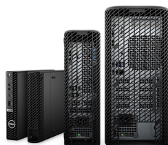
OPTIPLEX CABLE COVERS

Wired mouse with fingerprint reader offers convenient and secure login and online access without passwords.