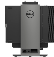
OPTIPLEX SMALL FORM FACTOR ALL-IN-ONE STAND

Minimize your footprint with this arm that offers easy installation and enhanced adjustability while keeping cables neatly hidden from view.