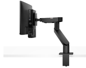
OPTIPLEX MICRO DUAL VESA MOUNT WITH ADAPTER BRACKET

This mount allows the Micro to be VESA mounted to select Dell E Series displays.