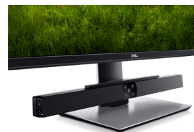
DELL PROFESSIONAL SOUND BAR - AE515M

Take your work to new heights with this 23.8-inch FHD monitor with a wide color coverage. Features ComfortView Plus an always-on built-in low blue light screen, fast connectivity and transfer speeds.