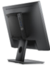
OPTIPLEX MICRO ALL-IN-ONE MOUNT FOR DELL E SERIES MONITORS

Small footprint mounting solution adapts to your environment, with cable management and monitor height adjustability, tilt, swivel and pivot functions.