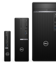
OPTIPLEX DUST FILTERS

Thermally tested custom cable covers offer an easy to install and attractive way to manage cables and secure ports.