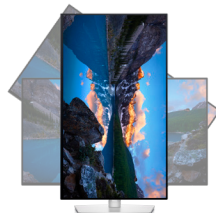
DELL ULTRASHARP 24 MONITOR - U2422H

Optimize your workspace with this efficient 23.8" monitor built with an ultrathin bezel, a small footprint and comfort-enhancing features.