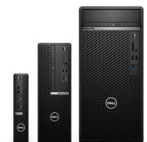
OPTIPLEX DUST FILTERS

Thermally tested custom cable covers offer an easy to install and attractive way to manage cables and secure ports.