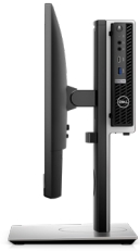
OPTIPLEX MICRO ALL-IN-ONE STAND

Small footprint mounting solution adapts to your environment, with cable management and monitor height adjustability, tilt, swivel and pivot functions.