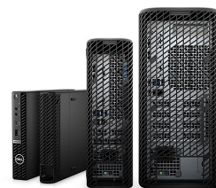
OPTIPLEX CABLE COVERS

Experience exceptional audio clarity with this Teams certified wired headset that allows you to wear the microphone on either side for a customized fit.