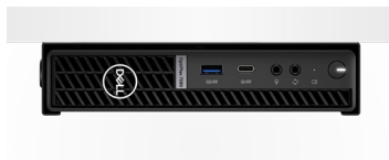
OPTIPLEX MICRO VESA MOUNT WITH ADAPTER BRACKET

Mount your system on a wall or under a surface with a VESA-compatible DVD+/-RW enclosure with full optical drive access. Includes an adapter box to securely house the system's power adapter.