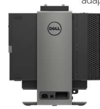
OPTIPLEX SMALL FORM FACTOR ALL-IN-ONE STAND

Minimize your footprint with this arm that offers easy installation and enhanced adjustability while keeping cables neatly hidden from view.