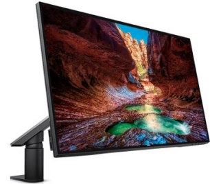
Dell UltraSharp 27 InfinityEdge Monitor with ARM | U2717DA